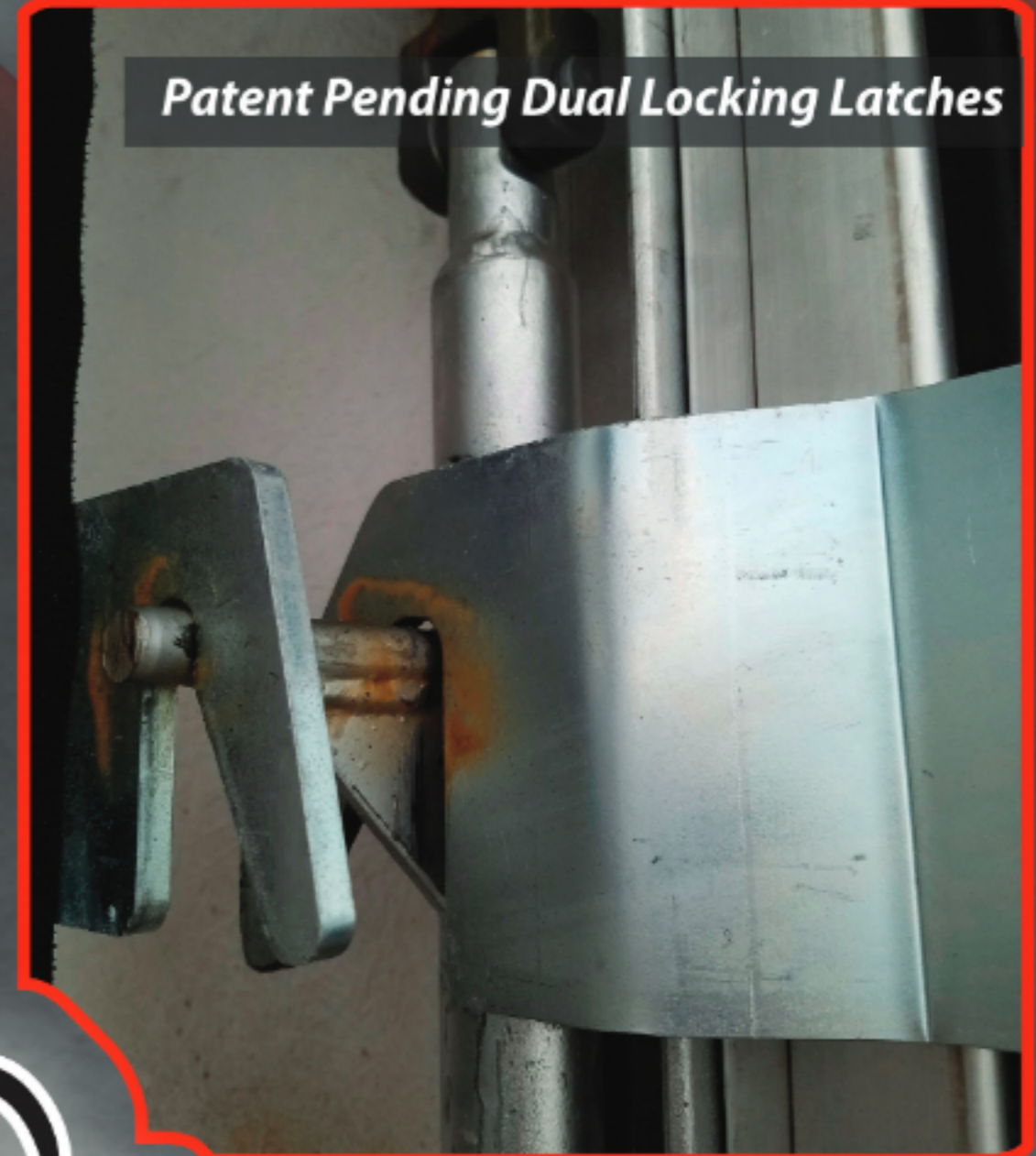
Patent Pending Dual Locking Latches

LCS POWAIR Heavy Duty Hardware is combined with simplistic design and off the shelf components for easy replacement