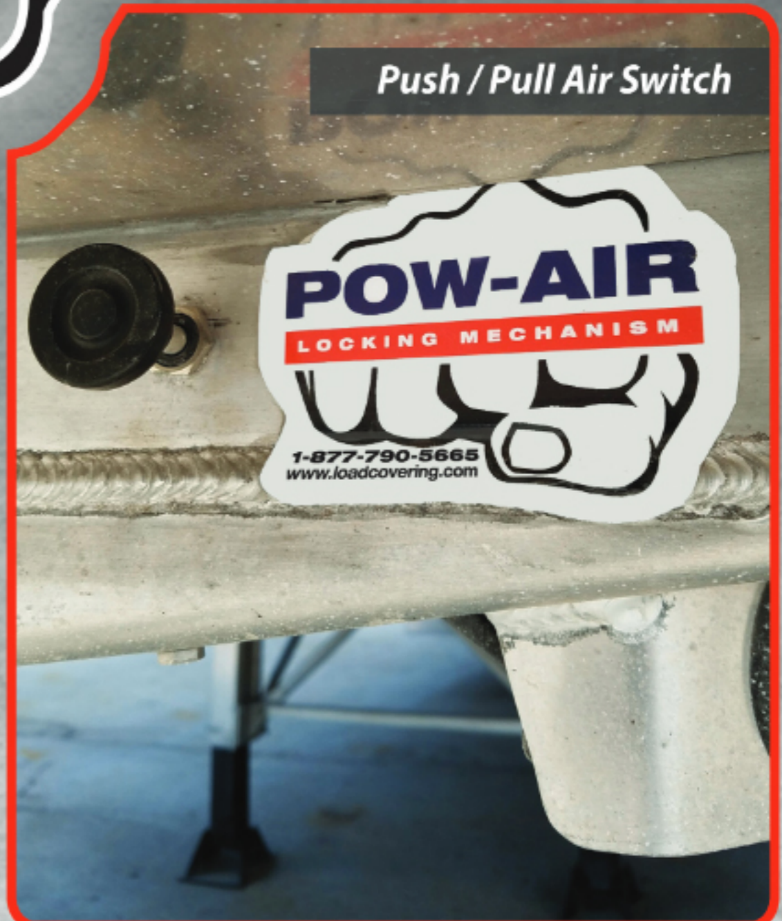
Push / Pull Air Switch