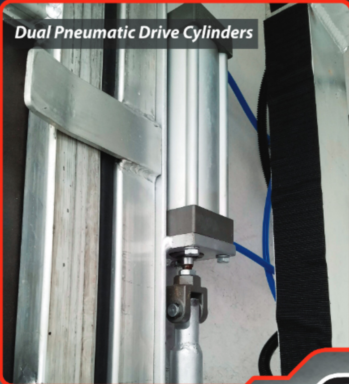
Dual Pneumatic Drive Cylinders

LCS has a Patent Pending 4 point dual locking latch design on both driver and passenger sides ensuring simultaneous engagement and disengagement of POWAIR locks