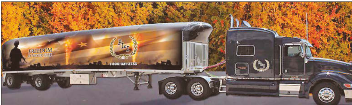
LCS developed the first and only dome roof sliding system widely known today as the Slide Kit™