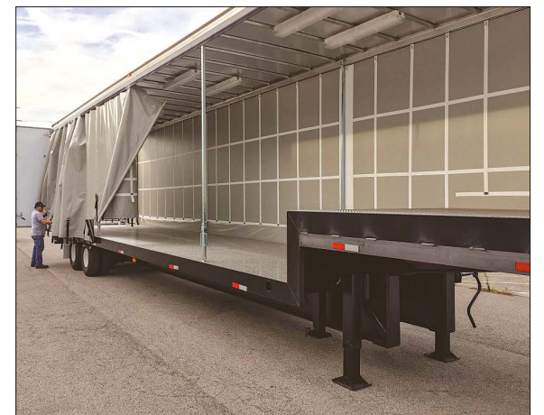
ALCS Hard Roof /Soft Side Curtain Systems.

If overhead loading is not a requirement, LCS is one of only 2 manufacturers in North America that offers a Hard Roof, Soft Side European alike Curtain Wall System where if the load side shifts you are always guaranteed to get it off the trailer. Curtain Wall Systems are much more forgiving then a retractable with much reduced maintenance required.