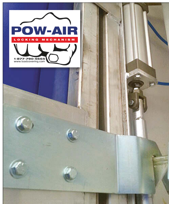
POWAIR- Air Release Front Lock Mechanism.

of their load covering systems. LCS recognized the impact of lost load versatility and the potential inability to be able to haul higher loads that the entire rolling covering system's future could be in jeopardy. So LCS took to the challenge of finding a way to increase the maximum height of a system above the deck of a trailer while increasing fuel efficiency, reducing wind drag and promoting driver safety.