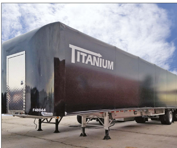
The Windmaster SMARTLOOK™. Our newest Aerodynamic, Patent Pending load covering system.

The next project was to improve overall fuel efficiency for the standard Square Top system, known as The LOOK™. This project was initiated as a result of the rapidly growing concerns made by fleet owners over mounting fuel costs prompting trucking fleets to reduce the heights