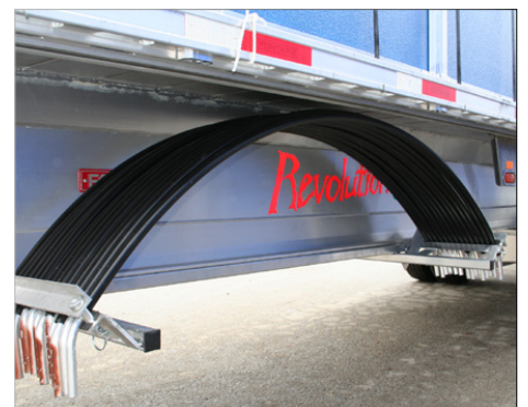
Side Kit Bow Storage

Contact our parts desk to see how we can help you cost effectively manage your storage and cargo equipment needs!