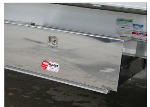
Post & Panel Storage