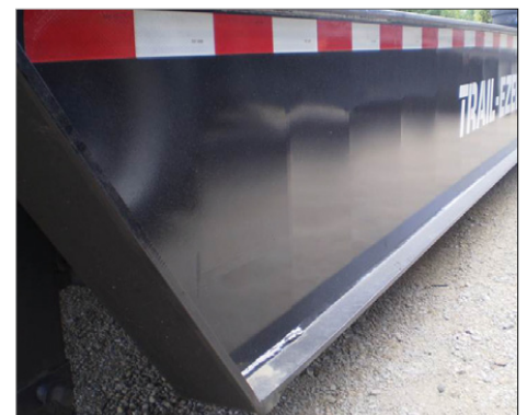
Non traditional side rail