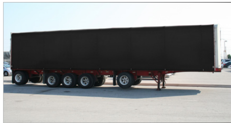
Reconditioned System for Sale