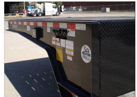
Hydraulic levers in way of track

At Load Covering Solutions our engineering experts, field technicians and install dealers have the creativity and expertise to solve every load covering problem and deliver a product that exceeds our customer’s expectations. The pictures tell the story of the details that need to be considered in each installation to make sure the final product meets the customer’s requirements.