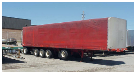
Used System Purchased

Here's your answer! LCS is in the business of selling used sliding systems. As you read we are looking for good used Conestoga Systems that will be refurbished with a new 20 oz tarpaulin covering, new rear flap, new roller bearings, reconditioned stainless track insert, reconditioned locking mechanisms and offer back to the trucking industry for a very affordable price. LCS guarantee's that our reconditioned systems, though not new, will provide significant years of working life.