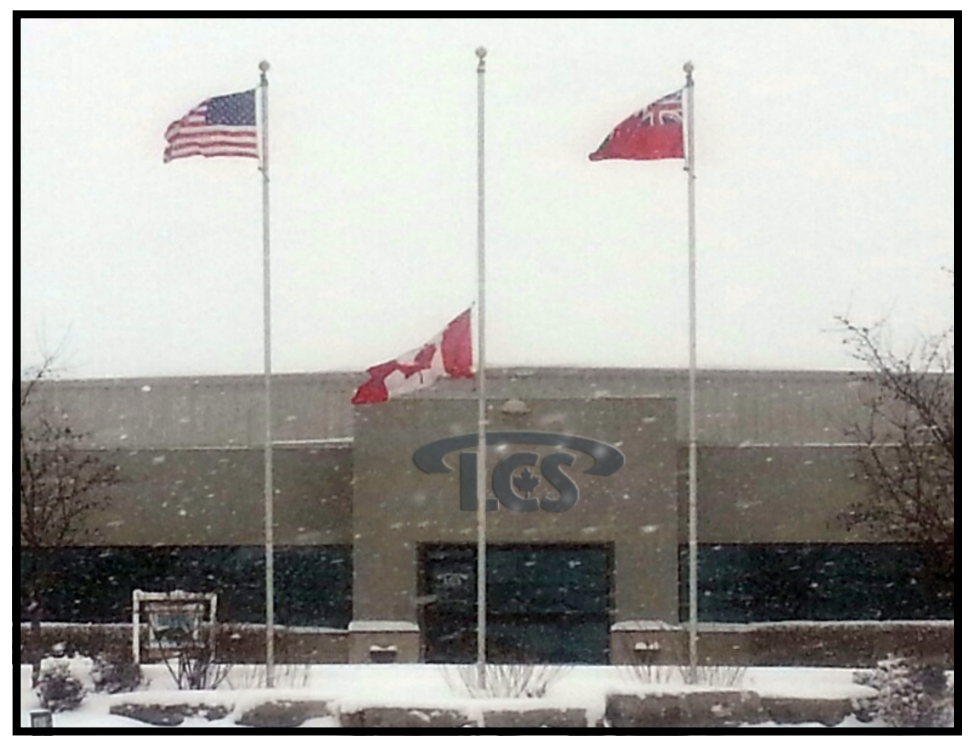
December 2013 – Canadian flag at half mast to recognize the passing of Jerry Collis